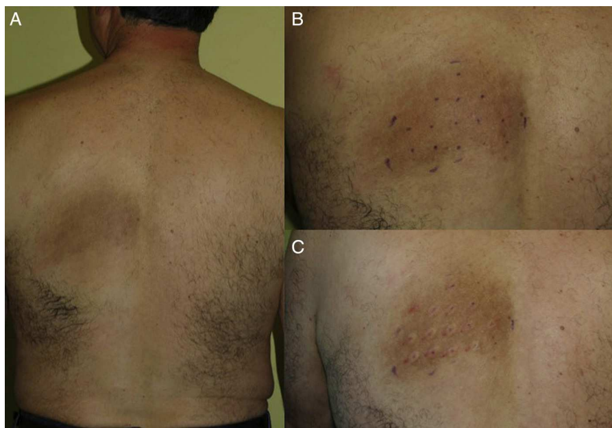
Figure 1 Case 1. A, Prior to treatment. B, Injection point marks. C, Immediately after treatment. Visible edema at injection sites.