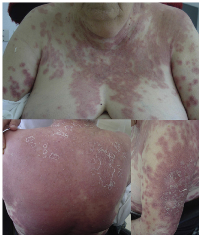
Figure 1 Erythematous, edematous plaques with multiple nonfollicular pustules.

Blood tests showed intense leukocytosis ( 38 \times 10^9/L ) with neutrophilia ( 34.6 \times 10^9/L ), normal blood cell morphology, and increased levels of acute phase reactants, including fibrinogen and C-reactive protein.