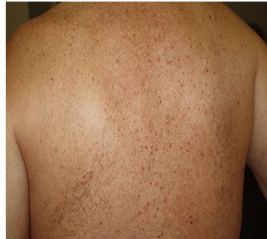
Figure 2 Vesicular eruption.

high rate of vascular changes such as microthromboses, endothelialitis, fibrin deposition, and immunoreactant deposits. Immunofluorescence analyses revealed microvascular deposits of IgM, IgA and C3 on vessel wall 31 . Herman et al. in their case series evaluated 31 patients of recent onset CLL with skin biopsies and immunofluorescence. The histopathologic features were consistent with the diagnosis of chilblains and the immunofluorescence was suggestive of small vessel vasculitis in seven cases. They concluded that these lesions may be due to lifestyle changes adopted during the lockdown period and may not have a direct association with COVID-19 32 . It has been hypothesized that due to early IFN-1 response in young patients, microangiopathic changes produces chilblain-like rashes but in older patients delayed IFN-1 response leads to cytokine storm and increased rate of morbidity and mortality 33 .