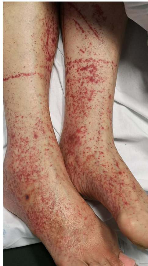
Figure 4 Petechiae (Image credit: Dr. Ana Rodriguez Villa).

This rash is mainly seen in older patients with a mortality rate of 10% [Fig. 3] 21 . It has been proposed that reduction in blood flow to cutaneous vascular system and deoxygenated blood flow due to disseminated intravascular coagulation (DIC), predisposes cutaneous system to develop necrosis in COVID-19 infected patients 20 . Moreover, it is associated with deposition of C5b-9 and C4-d in the microvasculature 40 . One study reported a case with purple ischemic digits of the feet and hands. Blood tests showed