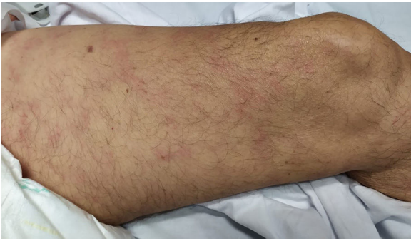
Figure 3 Livedo.

toms in 2 patients, with COVID-19 symptoms in 3 patients and after COVID-19 symptoms in 19 patients 35 . Histological data of 3 patients with vesicular rash showed non-ballooning acantholysis, dyskeratosis, intraepidermal vesicles, dermal infiltration of eosinophils and multinucleated cells with no signs of vasculitis. The vesicular eruptions seen in COVID-19 differ from varicella-like exanthema in which the main histological features are nuclear atypia, large multinucleated cells, ballooning acantholysis and vasculitis 36 . For accurate recognition of COVID-19 associated varicella-like exanthema it seems necessary to rule out herpes simplex-1 virus, herpes simplex-6 virus, and Epstein-Barr virus, and varicella zoster virus 37 .