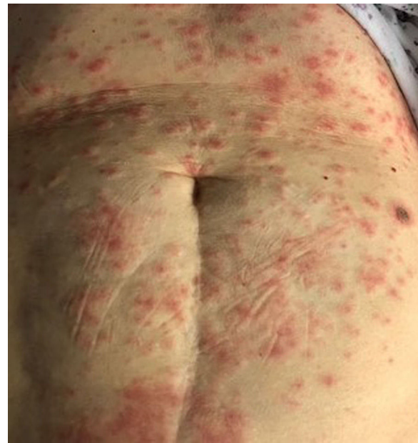
Figure 5 Erythema multiforme like eruption.

late in the course of the disease when the patients have turned PCR negative but this is not absolute as they can also develop early when the patient is still PCR positive. These lesions usually indicate a good prognosis. Some skin eruptions are associated with severe COVID-19, like necrotic skin lesions and retiform purpura. These patients have abnormal coagulation profile and demonstrate thrombotic vasculopathy on histopathology 44 .