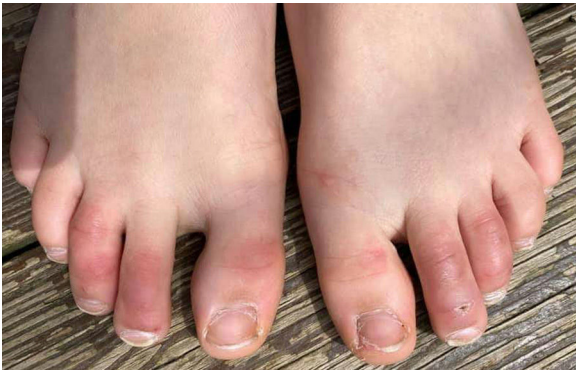
Figure 1 Covid toes in a child.

§ Prevalence has been inferred mainly from the recent systematic reviews by Lee et al. 8 , Perna et al. 18 and Zhao et al. 23 .