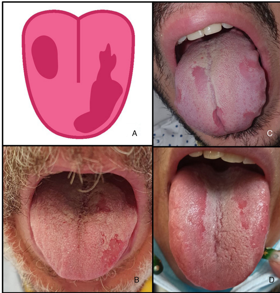
Figure 2 Glossitis and patchy depapillation (3.9%) in patients with COVID-19. A, Illustration showing glossitis with patchy depapillation observed in patients with COVID-19. B–D, Patients with glossitis and patchy depapillation. Fungal culture and serology were negative. COVID-19 indicates coronavirus disease 2019.

ter understand this association and its possible etiology and pathogenesis.