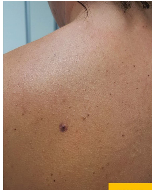
Figure 1 A violaceous papule surrounded by a homogeneous purpuric halo on the back of a 43-year-old woman.

The presence of estrogen hormone receptors demonstrated by immunohistochemistry suggests that this hormone may accelerate endothelial proliferation and dilation, explaining the clinical behavior of THHs. 3 D2-40 positivity and negative immunostaining for CD34 in endothelial cells, along with an absence of actin-positive pericytes, suggest that these lesions may have a lymphatic origin. 4