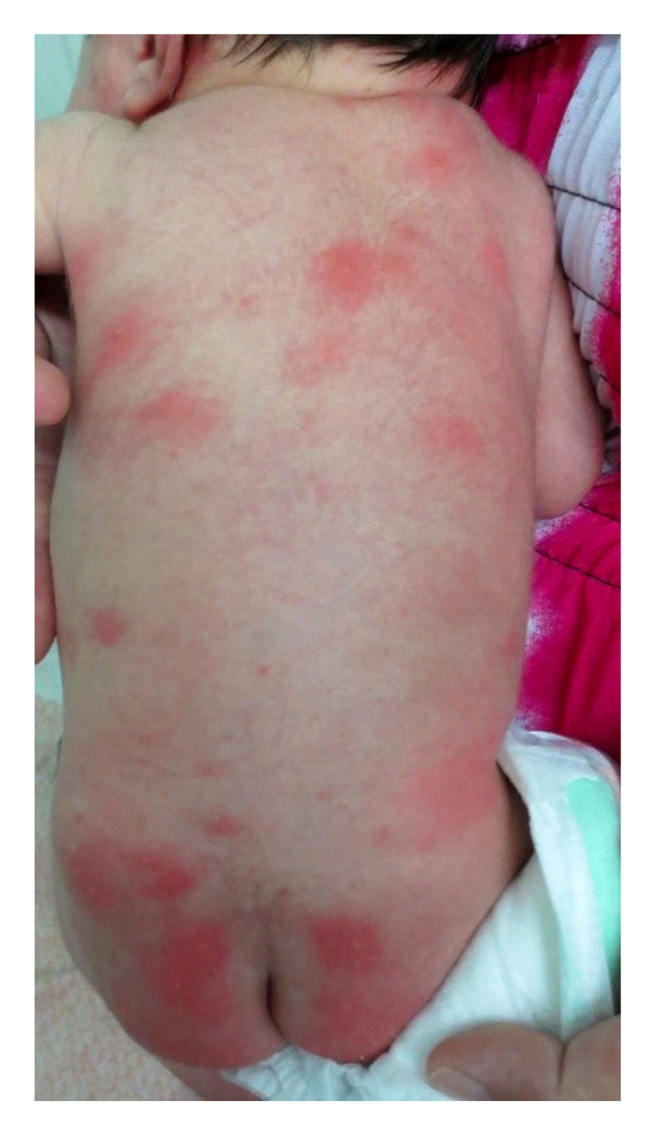
Figure 5 Erythema toxicum neonatorum.

Less common categories were traumatic lesions (in 12.8%; 95% CI, 11.7%–14.1%) and congenital anomaliies (in 3.5%, 95% CI, 2.9%–4.3%).