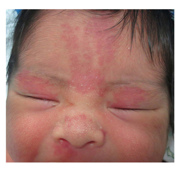
Figure 6 Salmon patches.