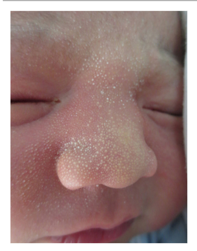
Figure 3 Sebaceous hyperplasia.