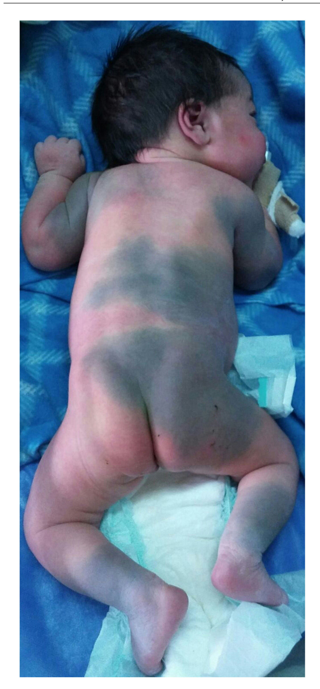
Figure 8 Unusual presentation of dermal melanocytosis.

tions with different factors, 3-11,14 but until now data have not been available for Uruguay.