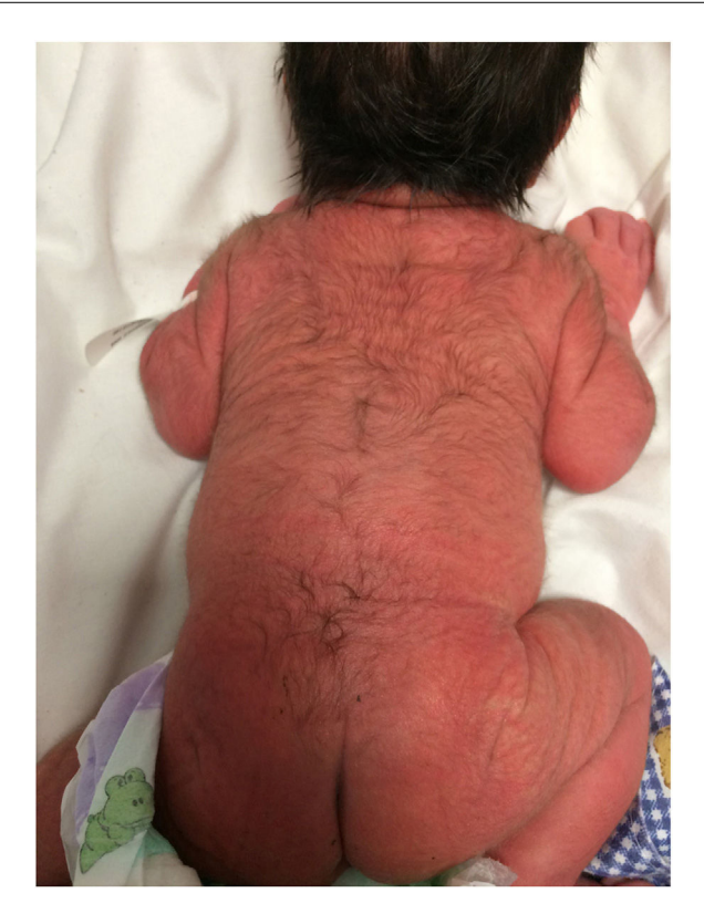
Figure 2 Lanugo.

The median age of the 2777 mothers was 23 (IQR, 20–28; range, 13–48) years. Most infants (74.7%) were delivered vaginally (Table 1).