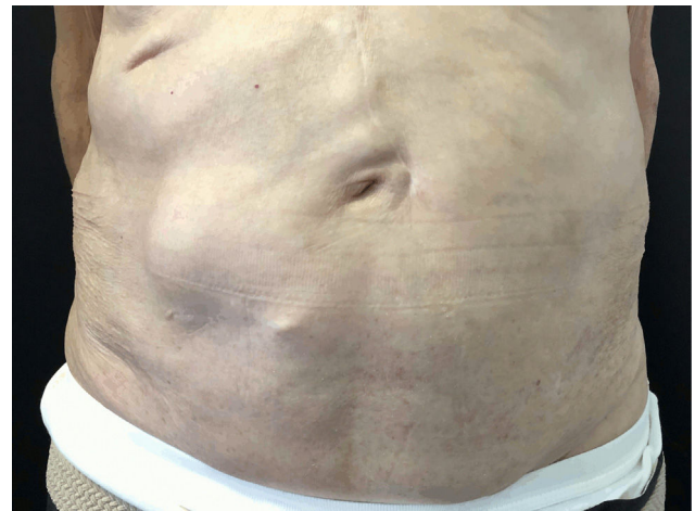
Figure 2 Complete resolution of pseudohernia after 8 months of follow-up.

In conclusion, abdominal pseudohernia is a rare complication of HZ that usually has a good prognosis. Although the suspected diagnosis is clinical, it is advisable to perform a noninvasive imaging test to rule out a true hernia.