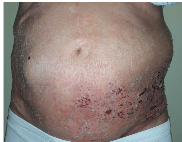
Figure 1 Pseudohernia on the left flank coinciding with herpes zoster in the crusting phase.

wall without evidence of hernia. An electroneuromyographic study revealed no alterations. Given the temporal relationship between the appearance of the rash and the protrusion, the case was oriented as abdominal pseudohernia due to HZ. After 8 months, the patient showed a complete clinical recovery (Fig. 2).