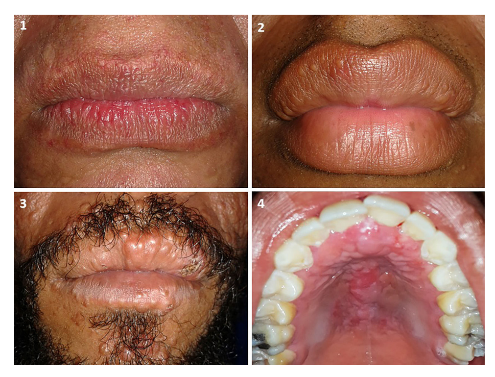
Figure 1 Leprosy-related lesions. A, Leprous plaque on the upper and lower lips. B, Lepromas on the upper lip. C, Lepromas on the upper and lower lips. D, Leproma on the palate.