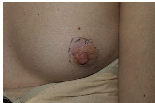
Figure 1 Indurated, erythematous, and elongated lesion affecting the left areola. The lesion was painful to touch.

For many years, mamillary fistula was thought to result from obstruction of a distal milk duct by squamous metaplasia, with keratinization and/or epidermalization of the duct. However, it was recently proposed that mamillary fistula originates in a hair follicle, where the initial event is occlusion of the follicle because of hyperkeratinization. This leads to dilatation and rupture of the duct, with release of secretions into the subcutaneous cell tissue and, therefore, an inflammatory reaction, secondary bacterial infection, and, finally, formation of abscesses with drainage of sinus tracts and fistulas in the area of the areola. 3 In this case, the squamous metaplasia identified in the biopsy specimens would represent the response of the tissue to a chronic inflammatory process, thus indicating that it is a result of