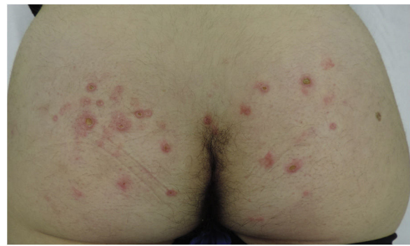
Figure 1 Erythematous papular lesions on the buttocks with signs of excoriation.

We present a case of hookworm folliculitis, an atypical presentation of CLM syndrome. Hookworm folliculitis is a rare entity (the largest series described in the literature consists of 7 patients), 1 and may be due to a hypersensitivity reaction to the presence of the nematode in the follicular canal. 2-4