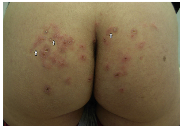
Figure 2 Worsening of the lesions on the buttocks with the appearance of raised serpiginous tracks (arrows).