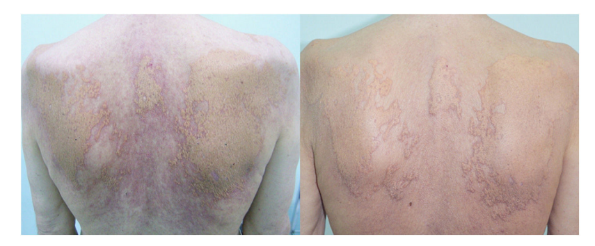
Fig. 1 Xanthoma-like plaques on trunk, that had composed with the accumulation of yellow-orange papules on an erythematous background, and erythematous papules. Phototherapy resulted with healing of the erythematous papules, erosions and thinning of the yellow-orange plaques.