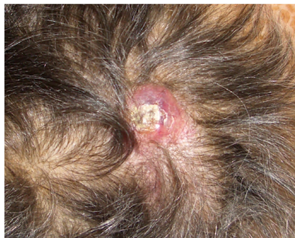
Figure 1 Erythematous nodule with a superficial crust on the scalp.

Although GBM is the most common malignant brain tumor, extracranial metastasis is uncommon, and has been reported in only 2.7% of 148 patients with a histological diagnosis of glioma who were followed up for 5 years. 1 The most common sites of metastasis are the lung, pleura, and lymph nodes; skin metastasis is more rare. 2 In the current literature there are 7 reports of skin metastasis of cerebral glioma grades III to IV (Table 1). Ours is the first reported case of skin metastasis of GBM without recurrence of intracranial disease, 3 which is usually observed in patients with a history of invasive surgical procedures, suggesting a fundamental role of iatrogenic seeding. However, in 10% of patients extracranial metastasis occurs in the absence of previous surgical interventions 4 or at a site