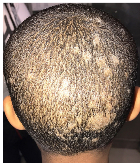
Figure 1 Tinea capitis in a 5-year-old black boy born in Spain. Multiple areas of alopecia with gray scales are evident on the scalp.

M. audouinii is a globally distributed anthropophilic dermatophyte fungus, and together with Trichophyton soudanense is the most common cause of tinea capitis in Africa, where it is endemic. Identification by MALDI-TOF MS involves characterization of the isolate's protein profile and comparison with those recorded in a protein library. The