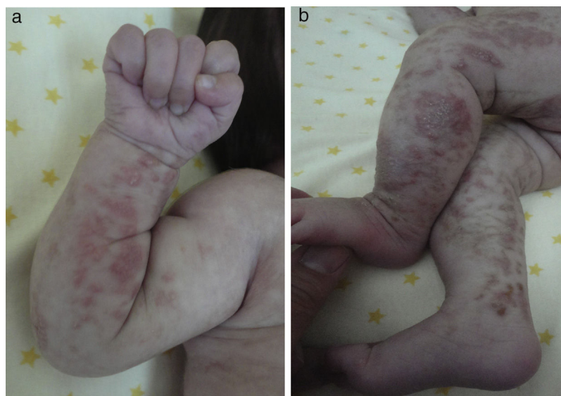
Figure 1 Blister-like erythematous lesions on the extremities corresponding to stage I disease (vesiculobullous lesions).

Eye impairment is observed in between 50% and 77% of patients. The most serious alterations involve the retina, 16 and retinal problems such as detachment and avascular retina are the most feared of complications. These can be treated with laser photocoagulation targeting retinal neovascularization. Cryotherapy can also be used and promising results have been observed with vascular endothelial growth factor inhibitors. 18 Optical coherence tomography images show internal and external retinal layer thinning. Eye abnormalities similar to retinoblastoma have been described in some cases of incontinentia pigmenti and include leukocoria, strabismus, intraocular calcification, and, as already