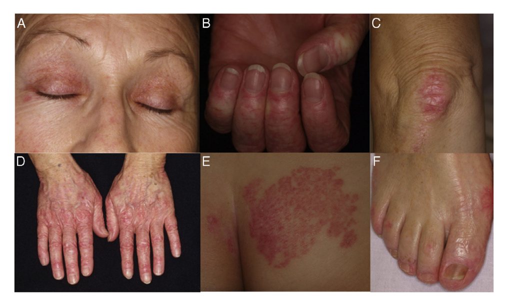
Figure 1 A, Periorbital heliotrope rash. B, Prominent periungual telangiectases. C, Erythematous, scaly plaque on the knee. D, Erythematous, scaly lesions on the dorsum of the interphalangeal and metacarpophalangeal joints. E, Erythematous, scaly plaque on the buttocks. F, Erythematous, scaly lesions on the dorsum and lateral aspect of the feet.