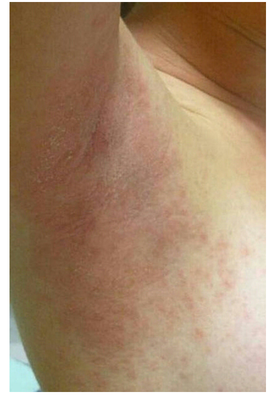
Figure 1 Erythematous, scaly plaques on the axillas.

We performed patch tests with the standard series of the Spanish Contact Dermatitis and Skin Allergy Research Group