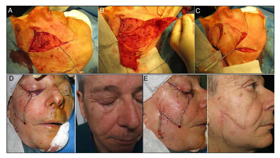
Figure 3 Mutaf triangular flap. A, Primary defect converted to a triangle. B, Raised flap made up of 3 opposing triangles. C, Final positioning of the flap. D and E, Immediate and later postoperative period (8 weeks). Front and side view.