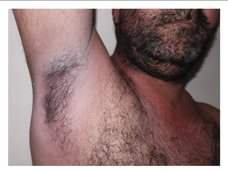
Figure 3 Image showing lesion resolution in the axillary area after treatment with narrowband ultraviolet B (NBUVB) phototherapy.

continued, albeit at a lower dose, after completing the phototherapy regimen.