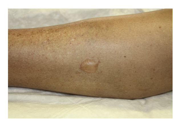
Figure 1 Patient 3: medium-sized blister containing serous fluid on the inner aspect of the right leg.

Samples for histopathology were acquired from 2 patients. Blister samples were collected for hematoxylineosin staining and healthy perilesional skin samples for analysis by direct immunofluorescence (DIF). In both patients, histopathology showed a subepidermal blister with fibrinoid deposits on the dermal floor and mild inflammatory infiltrate (Figs. 3A and 3B). Devitalization of the basal layer and keratinocyte necrosis were evident in the detached epidermis (Fig. 3C). The results of the DIF study were negative for both patients (Fig. 3D). Analyses requested for