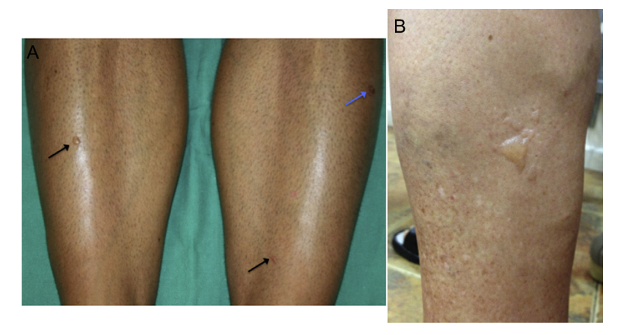
Figure 2 A, Patient 4: small blisters on healthy skin on the anterior aspect of both legs (black arrows) and secondary erosion (blue arrow). B, Patient 1: multiple blisters of various sizes grouped on the lateral aspect of the left leg.