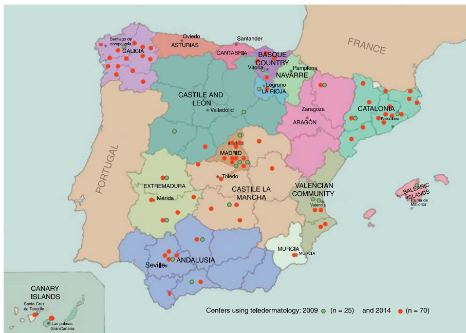
Figure 1 Spanish centers that use teledermatology by autonomous community, 2009 vs 2014 (25 in 2009; 70 in 2014).

Centros españoles con TD por autonomías 2009 vs. 2014 (25 en 2009/70 en 2014).