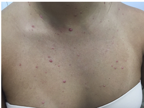
Figure 2 Diffuse scattered non-follicular based flesh-colored papules and small nodules, some with central indentations, were seen on the face and the trunk.