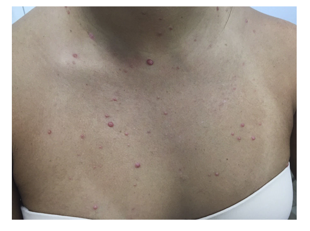
Figure 2 Diffuse scattered non-follicular based flesh-colored papules and small nodules, some with central indentations, were seen on the face and the trunk.