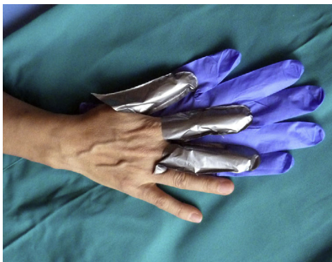
Figure 4 Proper protection of the dominant hand with 4H finger guards. Nitrile gloves should be placed over the finger guards to keep them in place and allow the beautician to move her hands dexterously.

less frequently, airborne mechanisms. The airborne transfer mechanism appears to be less common in association with permanent nail polish than with acrylic nails because permanent nail polish does not involve any powdered components and the nails are filed before the polish is applied, so powder containing acrylates does not spread through the air. The neck can also be affected by the same mechanisms that cause lesions to appear on the face. Lesions on the area of the forearms that rests on the contaminated work table are also common. Lesions caused by accidental spillage of polish are also seen on the thighs and abdomen. Patients also sometimes present mild paresthesia, which they describe as a tingling sensation and decreased sensitivity in the fingers. Nearly all affected beauticians present a certain degree of onycholysis, subungual hyperkeratosis, and splinter hemorrhages. There have been no reports of severe paresthesia 18 or onychodystrophy, 19 which do occur in ACD caused by acrylic nails (Fig. 4).