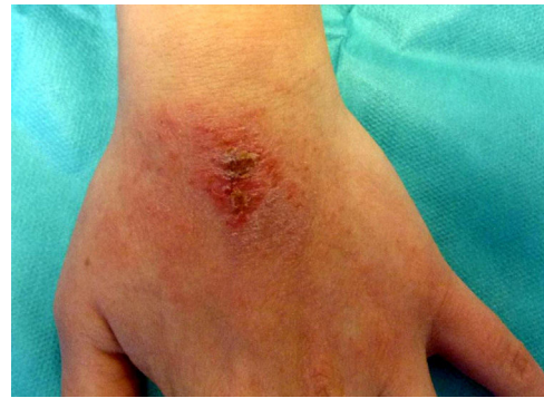
Figure 3 Eczema on the dorsum of the nondominant hand of a patient who reported using this area to wipe off the finger of the dominant hand, which she used to remove excess polish around the edges of the nails.

Both of these innovations can be used with either conventional or permanent nail polish.