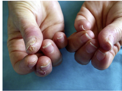
Figure 2 Characteristic lesions seen in beauticians: dry, fissured pulpitis on the first fingers of both hands, especially the dominant hand.

for at least 15-20 minutes. An alternative method is to douse cotton balls in solvent and hold them in place on the nails using special clips or aluminum foil. In some cases, a nail drill must be used to remove the polish completely.