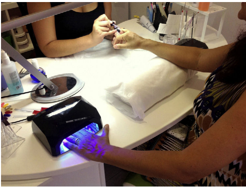
Figure 1 A beautician applies permanent nail polish at a work station equipped with 2 lamps (1 on each side of the customer). Note that the thumb of the left hand is not under the lamp. In order for acrylate to polymerize properly, the thumb must later be placed under the light separately.