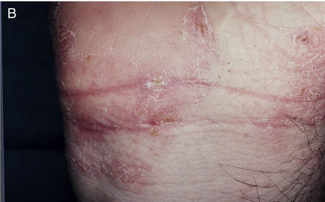
Figure 2 (a) and (b) Eczematous cutaneous lesions induced by oral ivermectin. Same patient as Figure 1.

toms of atopic diathesis (asthma, pollen sensitivity, spring rhinoconjunctivitis, etc.). None of the patients reported the use of irritants or changes in the use of soaps or fragrances. Haematological tests in the patients with the eczematous eruption did not show eosinophilia at baseline. IgE determination in 5 of them was within normal limits. No other