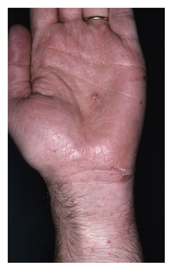
Figure 1 Scabietic burrows and nodules in volar surface of the wrists.

Within twenty-four to seventy-two hours after the administration of oral ivermectin, eleven patients (47.8%) presented new cutaneous lesions that were clinically distinct from those characteristic of scabies. The skin eruptions appeared after receiving the first oral ivermectin dose in 9 patients, after receiving the second dose in 1 patient, and after both the first and second dose in 1 patient. In all of the cases, the eruptions were characterized by itchy, scaly erythematous eczematous plagues located on the trunk and