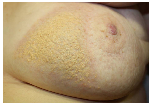
Figure 1 Yellowish plaque with a verrucous, papilliform surface surrounded by an erythematous halo on the left breast.

Despite the few cases published, it has been hypothesized that these xanthomatous cells may be histiocytes that survived the chemotherapy or radiotherapy or histiocytes from peripheral blood that engulf necrotic fat debris released by destroyed tumor cells and become xanthomatous cells. 1,3-5,7,9 It is plausible that chemotactic substances released in response to the tumor necrosis trigger the recruitment of monocytes, which then differentiate into histiocytes. These, in turn, would be activated, increase in size, and trigger the release of more chemokines, leading to the recruitment of additional monocytes and a considerable accumulation of histiocytes in response to the tumor necrosis. 7 This process does not appear to be