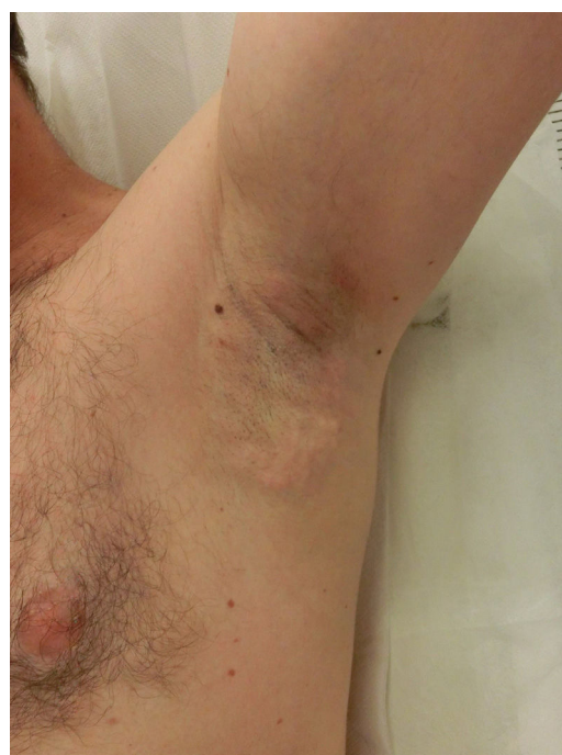
Figure 2 Local inflammation and subcutaneous nodules after treatment.

Compensatory hyperhidrosis seems to be a rare complication. It was reported in 2 patients, one of whom presented persistent facial sweating after the procedure. 3 Finally, another possible complication is permanent hair loss, an effect that has been described in 26% of patients. 17 This