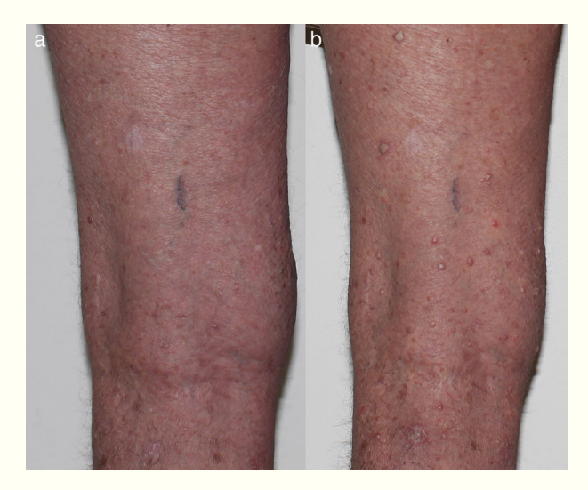
Figure 2 (a) Baseline photo prior to starting BRAFi and (b) multiple VKs on bilateral lower limbs 5 weeks post starting BRAFi.