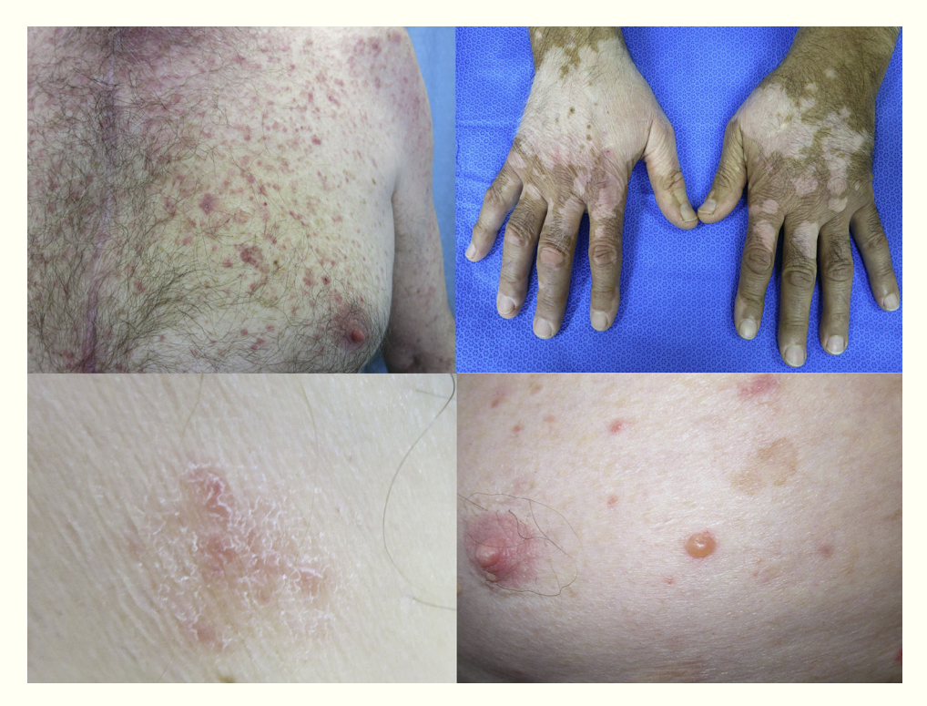
Figure 3 Anti-CTLA4 induced (a) maculopapular exanthema, (b) vitiligo, (c) anti-PD1 induced eczema and (d) bullous pemphigoid.