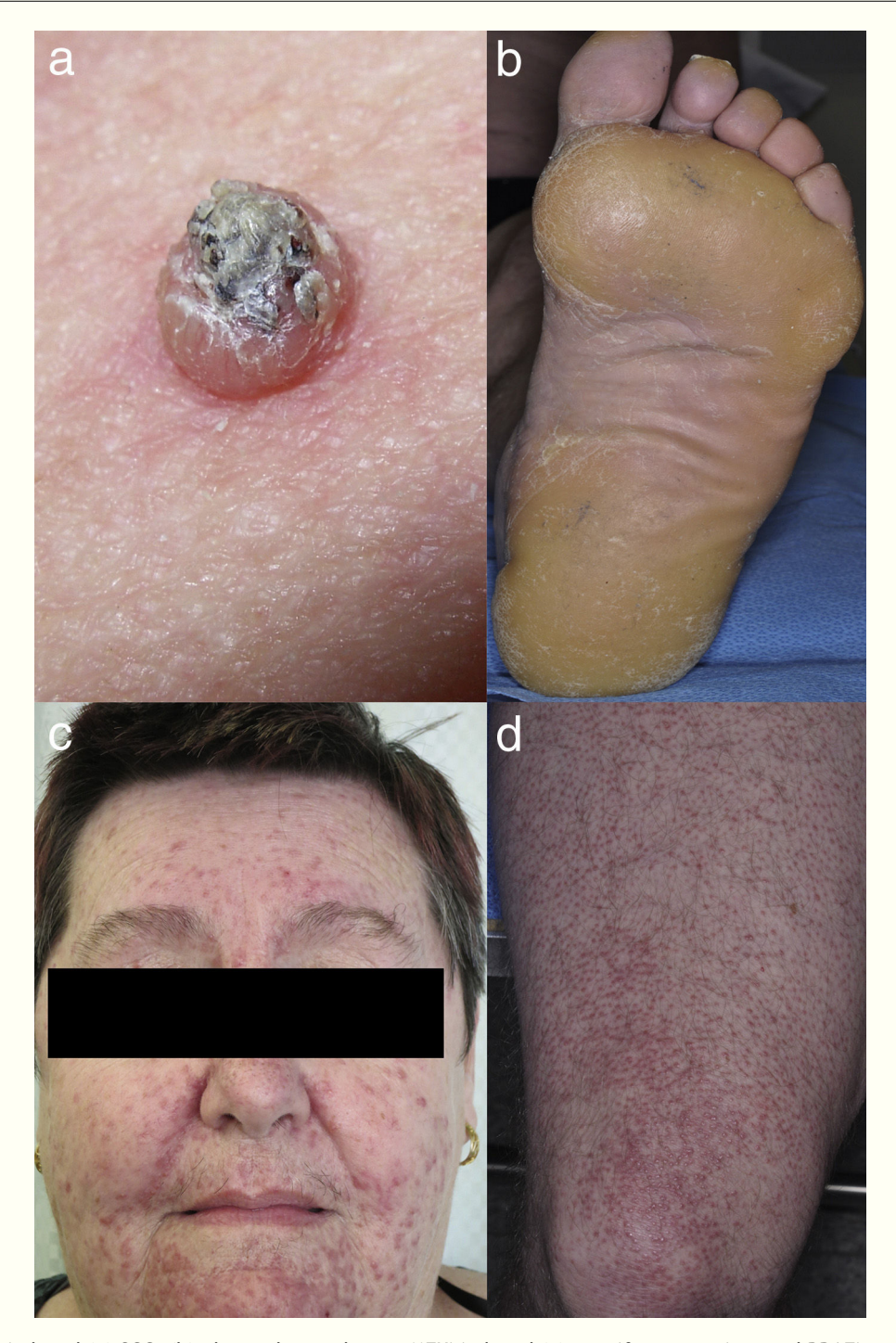
Figure 1 BRAFi induced (a) SCC, (b) plantar keratoderma, MEKi induced (c) acneiform eruption, and BRAFi and MEKi induced (d) folliculitis.

and 3 pruritus appears in 6-7%. 8,34 Pruritus could develop secondary to drug-induced xerosis, Darier's or Grover's diseases. 6,22,26