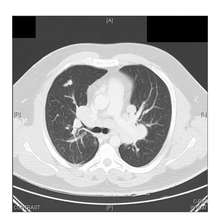
Figure 1 High resolution computed tomography, axial cuts: Multiple nodules forming masses were observed in the mediastinum, at both hila, and in the left supraclavicular fossa, in addition to nodular pulmonary involvement.

1578-2190/© 2014 Elsevier España, S.L.U. and AEDV. All rights reserved.