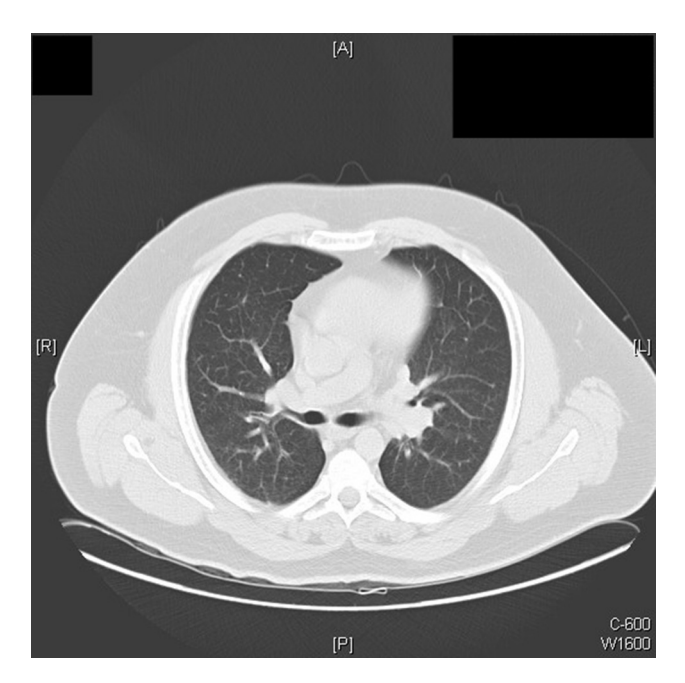
Figure 3 High resolution computed tomography showing a significant reduction in the pulmonary nodules and parahiliar lymph nodes 6 months after diagnosis and the interruption of anti-TNF treatment.

The ever wider off-label use of anti-TNF drugs in the fields of rheumatology and dermatology and in autoinflammatory diseases in other specialist fields explains the increase in the incidence of paradoxical phenomena in recent years.<sup>1</sup> These are exacerbations or the new appearance of inflammatory conditions that usually respond to the use of anti-TNF therapy,<sup>2</sup> such as psoriasiform rashes,<sup>3</sup> uveitis, and the onset of other granulomatous diseases (Crohn disease and sarcoidosis). Controversy continues over the etiologic and pathogenic mechanisms underlying these phenomena, although it has been suggested that TNF inhibition may provoke a dysregulation of the compensatory proinflammatory cascade.<sup>4</sup>