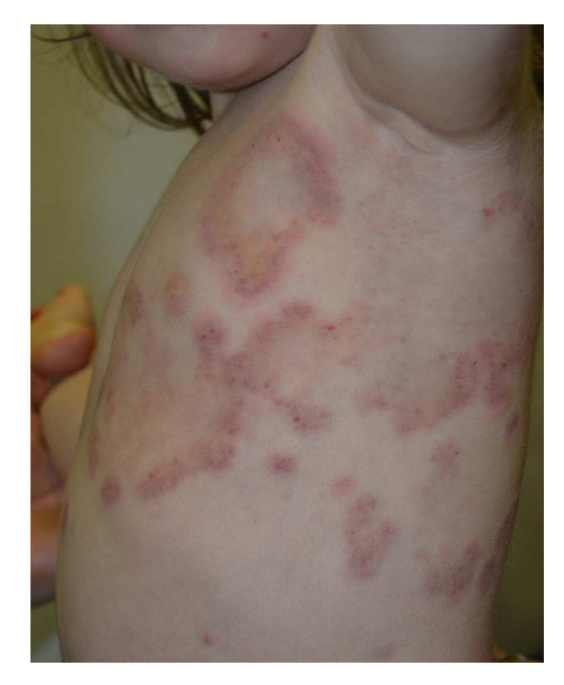
Figure 1 Multiple annular and polycyclic erythematous plaques with purpuric macules and indurated borders devoid of crusts, vesicles or desquamation distributed along her left chest and axillae.

Ten months after the beginning of plaques, a complete blood count was performed, which showed leukocytosis: 28,600 WBC/mm<sup>3</sup> with 22% monocytes and blast cells. A myelogram showed hypercellularity and 12% blast cells with monocyte-like appearance. The immunophenotype showed 17% immature monocytoid cells. Her fetal hemoglobin concentration was 24%. The translocation study (t9:22, t8:1