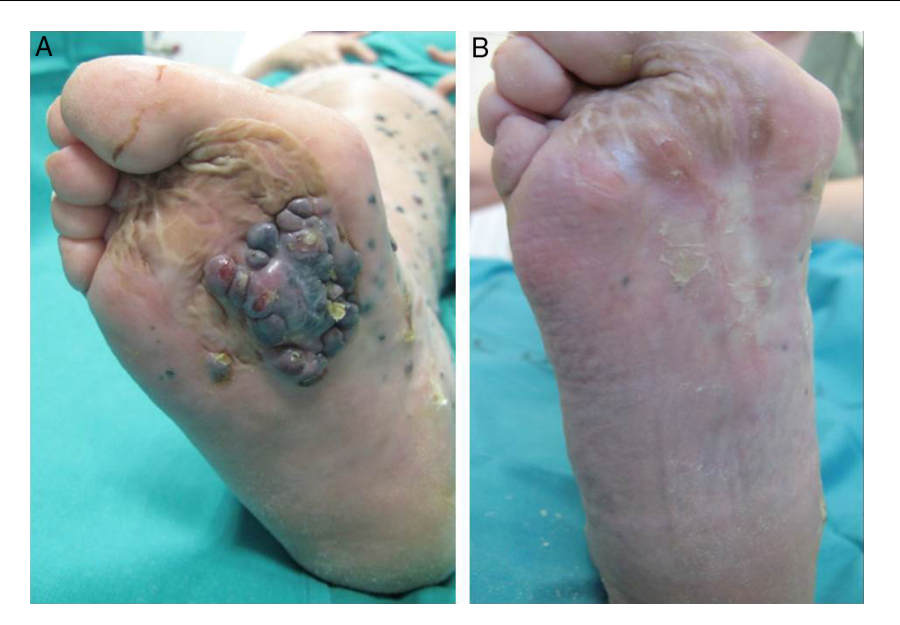
Figure 2 A, Large nodular plantar melanoma with multiple skin metastases along the leg. B, Resolution of the tumor 1 year after treatment with electrochemotherapy.

treatments are therefore necessary. Unfortunately, however, there is no consensus regarding the management of these cases because the available therapeutic options are limited, very expensive, and have variable results. As a result, the prognosis is poor and 5-year survival rates range from 12% to 37%.<sup>9</sup> There are various treatment options: imiquimod,<sup>10</sup> ECT, systemic chemotherapy,<sup>11</sup> radiotherapy,<sup>12</sup> intralesional interleukin-2,<sup>13</sup> interferon alfa,<sup>14</sup> intratumoral bacillus Calmette-Guérin,<sup>15</sup> and hyperthermic isolated limb perfusion.<sup>16,17</sup> These treatments have produced variable results.