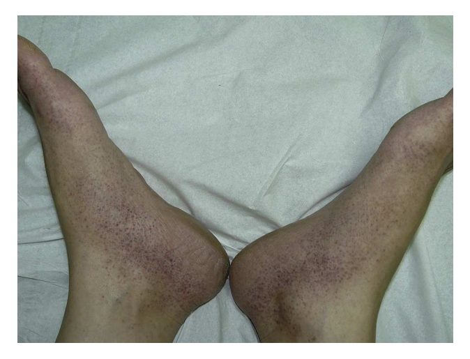
Figure 1 Purpuric exanthema with a sock-like appearance.

monoarthritis affecting the central axis of the body, and reported cervical pain, lower back pain, and hip pain. Twenty patients (40.8%) had fever, but their temperature generally remained under 38.5°C. Important diagnostic clues in our series included enlarged lymph nodes in the lateral cervical chains (3 cases), weakness or asthenia (3 cases), and swelling of the feet and hands (1 case).