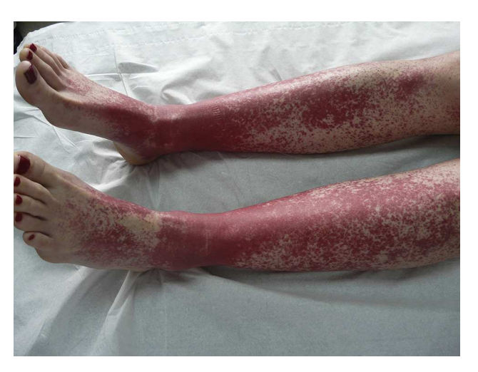
Figure 2 Palpable purpura on the leg clinically consistent with vasculitis, which was confirmed histologically.

Serology tests were ordered by the following departments: dermatology (23 cases), internal medicine (9 cases), rheumatology (9 cases), hematology (3 cases), gynecology (3