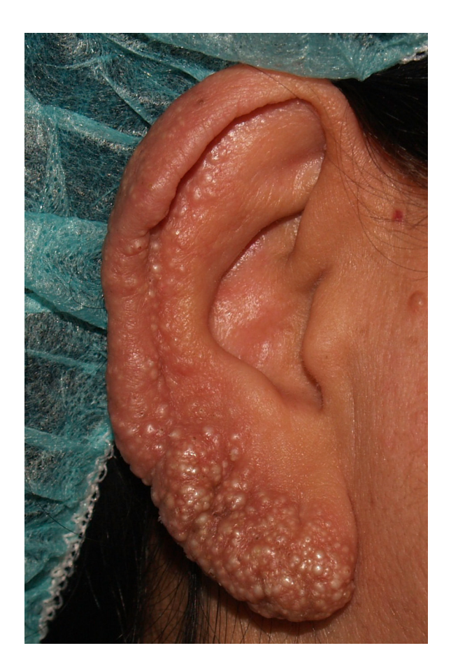
Figure 1 Multiple grouped smooth cystic lesions on the right helix and ear lobe.

to yellowish lesions. They are classified as primary if they arise spontaneously and are of unknown etiology, and as secondary if they appear in response to repeated trauma, burns, radiation therapy, topical corticosteroids or topical 5-fluorouracil, oral ciclosporin, or other types of aggression.<sup>1</sup>