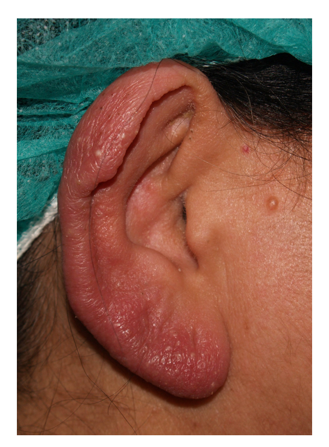
Figure 3 Marked reduction in the number of cysts after treatment with photodynamic therapy.

Milia en plaque is a rare type of primary milia that was first described in 1903 by Blazer and Bouquet.<sup>2</sup> The etiology and pathogenesis of this rare variant are unknown, although associated cases of pseudoxanthoma elasticum and discoid lupus erythematosus have been reported.<sup>3,4</sup> The condition is more common in middle-aged adults, with a certain predominance in women.<sup>5</sup>