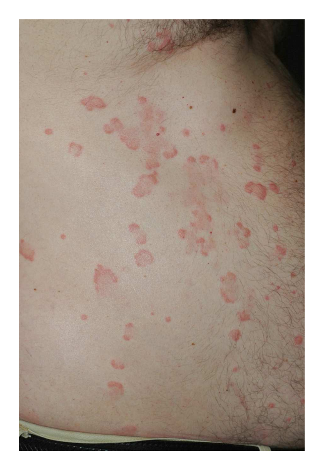
Figure 1 Urticarial plaques with purpuric borders on the trunk.

The lesions lasted for over 24 hours in 14 patients (93%) including all 7 patients with low complement levels. They