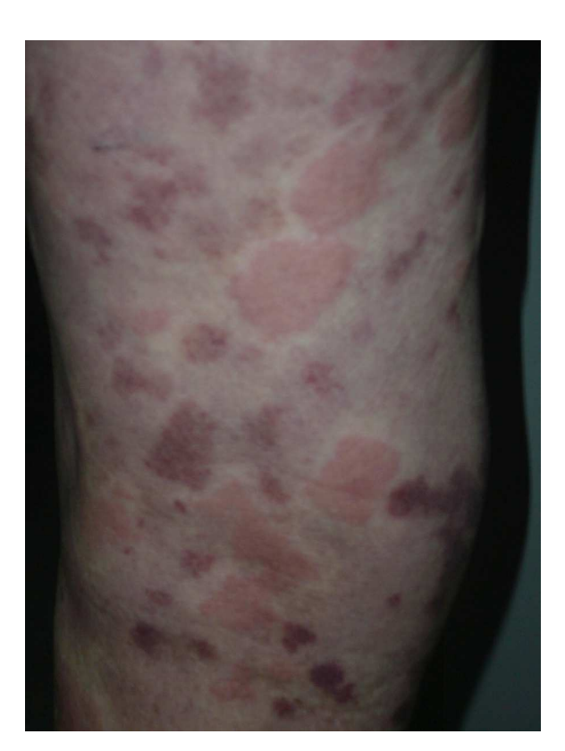
Figure 3 Residual purpuric plaques and erythematous, edematous lesions on the leg.

Seven patients (46.66%) had UV as the sole manifestation of disease and 8 (53%) had associated systemic involvement. The systemic disease preceded UV in 1 case and developed at the same time in the other 7. The most common associated disease was SLE (3 cases, 37.5%); the other diseases (present in 1 patient each, 12.5%) were mixed connective-