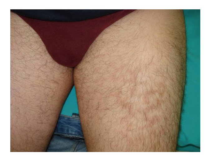
Figure 1 Reticulated hyperpigmented macules with ill-defined borders on the anterior aspect of the left thigh of the first patient.

The first patient was a 24-year-old male computer science student with a 4-month history of a reticulated