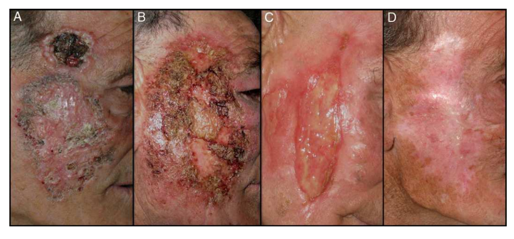
Figure 2 A, Ulcerated giant basal cell carcinoma on the right cheek and temple. B, Impetiginous exudative erythematous tumor plaque after application of topical imiquimod 5% combined with oral acitretin for 1 month. C, Granulation tissue after 2 months of local radiotherapy. D, Permanent resolution of the tumor at 15 months of follow-up.

the right cheek and temple. Histopathology confirmed the tumor to be infiltrative BCC. Given the size and location of the lesion, the skin tumor board rejected conventional approaches such as surgery and radiotherapy. The favorable outcome reported in the case described above led the board to recommend starting combination therapy with imiquimod 5% cream and oral acitretin (25 mg/d). Marked inflammation was evident 1 month later (Fig. 2B). After 15 weeks, the size of the tumor had been reduced to a maximum size of 3 x 4cm. However, after 6 months, the tumor was seen to be progressing, possibly owing to a lack of adherence. As the patient refused surgery, we decided to initiate local radiotherapy (200 cGy administered in 30 doses) (Fig. 2C). No recurrence of giant BCC has been detected after 2 years of follow-up (Fig. 2D).