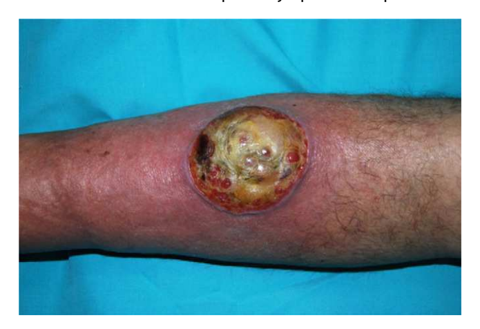
Figure 1 Ulcer several centimeters in diameter with a purple border.

A skin biopsy revealed a monomorphic infiltrate of large cells with abundant eosinophilic cytoplasm and prominent