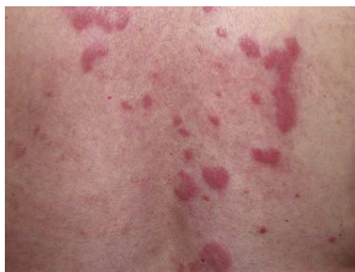
Figure 3 Characteristic lesions of lupus erythematosus tumidus on the back.

(Figs. 1-3); in addition, they heal without leaving a scar or hypopigmentation. 9-12,14-16 The lesions tend to appear in crops, almost always related to exposure to the sun, mainly during the spring and summer. It is important to determine the course of lesions after exposure to the sun, as this helps to differentiate LET from polymorphous light eruption. In LET, the lesions do not appear immediately, but rather after a latency period that varies between 24 hours and several weeks. 11,12,17,18 Moreover, they tend to persist throughout the summer and even into the autumn. Below, we look in