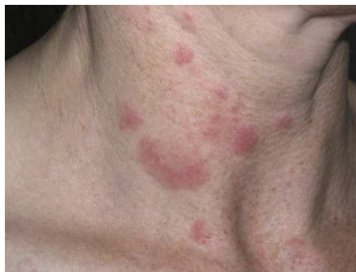
Figure 1 Characteristic lesions of lupus erythematosus tumidus on the neck.

The manifestations of LET consist of erythematous papules, plaques, or annular lesions with a succulent appearance; lesions develop mainly on sun-exposed areas such as the neckline, shoulders, face, and arms. The features that differentiate LET lesions from those of DLE and SCLE are the absence of desquamation, follicular plugs, or atrophy