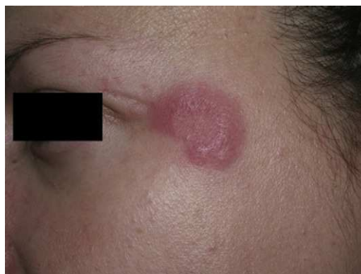
Figure 2 Characteristic lesions of lupus erythematosus tumidus on the face.

(Figs. 1-3); in addition, they heal without leaving a scar or hypopigmentation. 9-12,14-16 The lesions tend to appear in crops, almost always related to exposure to the sun, mainly during the spring and summer. It is important to determine the course of lesions after exposure to the sun, as this helps to differentiate LET from polymorphous light eruption. In LET, the lesions do not appear immediately, but rather after a latency period that varies between 24 hours and several weeks. 11,12,17,18 Moreover, they tend to persist throughout the summer and even into the autumn. Below, we look in