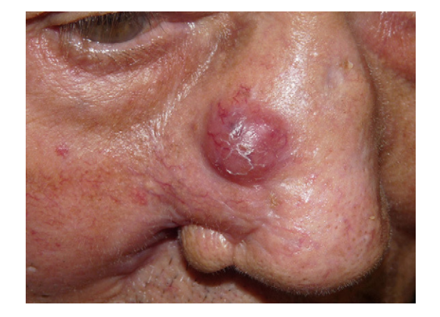
Figure 1 Nodule of firm consistency measuring 1 cm, with multiple telangiectases in the upper part of the skin flap and infiltration in the lower part of the scar.

sites,<sup>3</sup> decubitus ulcer, Sister Mary Joseph's nodule, pyoderma gangrenosum,<sup>9</sup> tetanus booster injection sites,<sup>10</sup> and within a basal cell carcinoma.<sup>11</sup> We reexamined the surgical specimens from the basal cell carcinomas removed from the patient's temple and nose but found no evidence of leukemic infiltration. Myeloid sarcoma in a patient with AML is normally a marker of recurrence and rapid disease progression. Of 4 such cases described in the literature, it was aleukemic in just 1 case<sup>7</sup>; in the other 3, its appearance coincided with transformation of a myelodysplastic syndrome into AML. Prognosis is generally very poor. It is noteworthy that while text books state that leukemia cutis can occur at the site of surgical scars, we found no such cases reported in the literature.