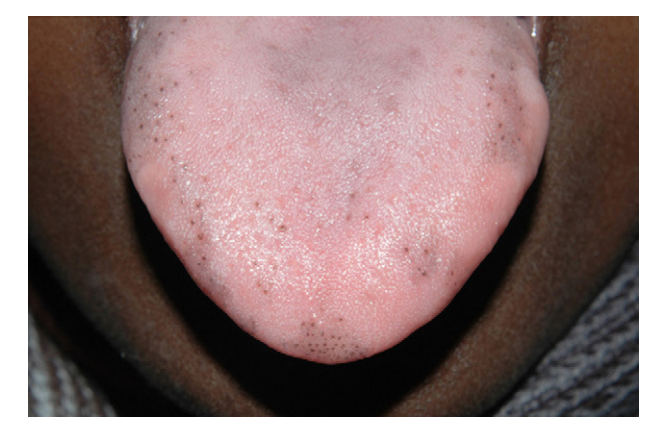
Figure 1 Case 1. Pigmentation limited to the fungiform papillae of the tongue, with irregularly distributed macules on the dorsum and lateral surfaces of the tongue in an indigenous African woman.

infestation.<sup>1</sup> Other authors have reported associations with dermatological disorders such as linear circumflex ichthyosis<sup>5</sup> and lichen planus<sup>6</sup>; an association with systemic diseases such as hemochromatosis, scleroderma, pernicious anemia, and