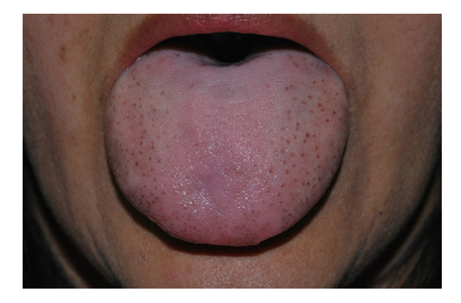
Figure 2 Case 2. Pigmented fungiform papillae of the tongue with a diffuse symmetrical pattern, predominantly affecting the lateral surfaces of the tongue in an indigenous South American woman.

Figure 1 Case 1. Pigmentation limited to the fungiform papillae of the tongue, with irregularly distributed macules on the dorsum and lateral surfaces of the tongue in an indigenous African woman.