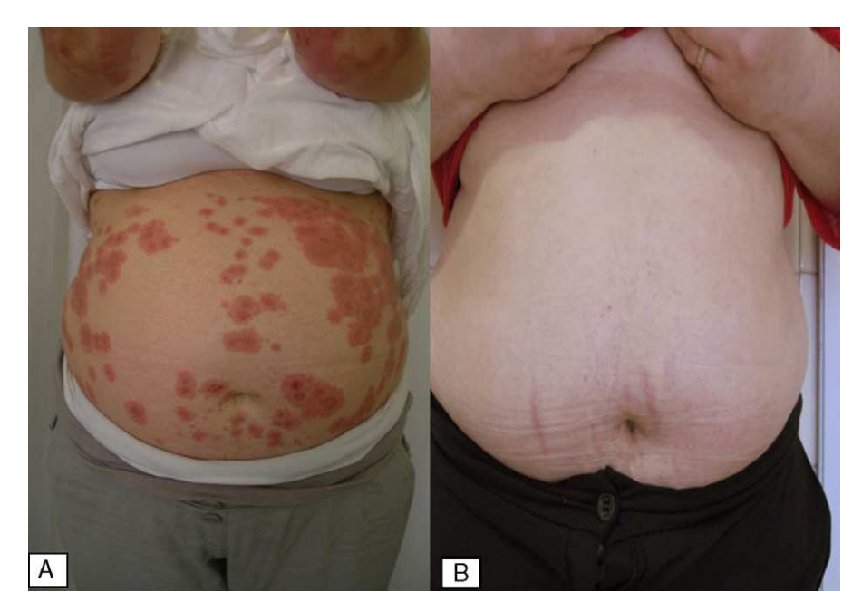
Figure 1 A, Papular eruption with tense blisters on the patient's abdomen. B, Condition of the patient at 6 weeks after delivery.

of 3 or 5 days, and most authors followed existing protocols at their hospitals. We considered applying this treatment pre- and postpartum in order to control skin disease in the final stages of pregnancy and prevent a possible recurrence during the puerperium. Jolles et al<sup>3</sup> observed that treatment with intravenous immunoglobulin in autoimmune bullous diseases is always more successful when used as adjuvant therapy (91%) rather than monotherapy (51%). Subsequently published cases of pemphigoid gestationis report therapeutic success in both situations.<sup>5–8</sup>