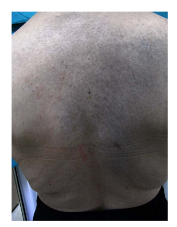
Figure 1 Bluish-gray macule on the right side of the back.

The pathogenesis of acquired dermal melanocytosis is uncertain. The existence of latent dermal melanocytes resulting from abnormal migration from the neural crest or from the hair bulbs or epidermis (a process known as ''dropping off'') has been suggested as a possible cause.<sup>4,8,9</sup> The dormant melanocytes may be reactivated by exogenous agents such as solar radiation, local inflammation, trauma, drugs, hormone therapy with estrogen or progesterone, or other, as yet undefined, stimuli. We could associate none of