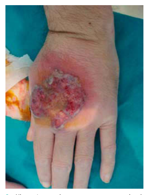
Figure 3 Ulcerative pyoderma gangrenosum on the dorsum of the hand.