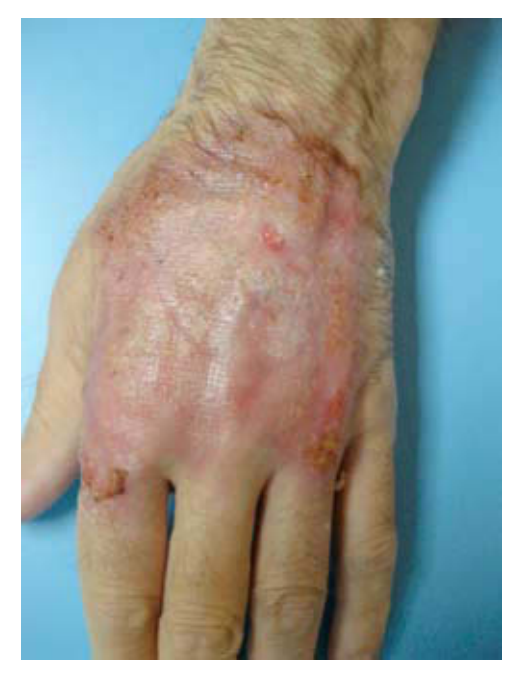
Figure 5 Residual scar of pyoderma gangrenosum after 2 months of treatment.