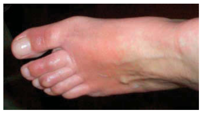
Figure 1 Eczema involving the toes, instep, ankle, and lower part of the leg.

In this case, we concluded that the lesions were consistent with an allergic, non-irritant etiology, as only