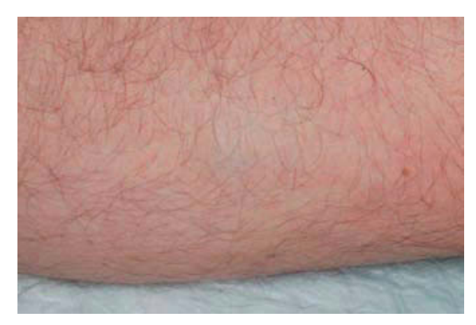
Figure 1 Clinical appearance of the lesion: a round well-defined bluish nodule.

We describe the case of a 59-year-old man who consulted due to a nodule that had appeared 4 years earlier and that had gradually increased in size over the previous 6 months.