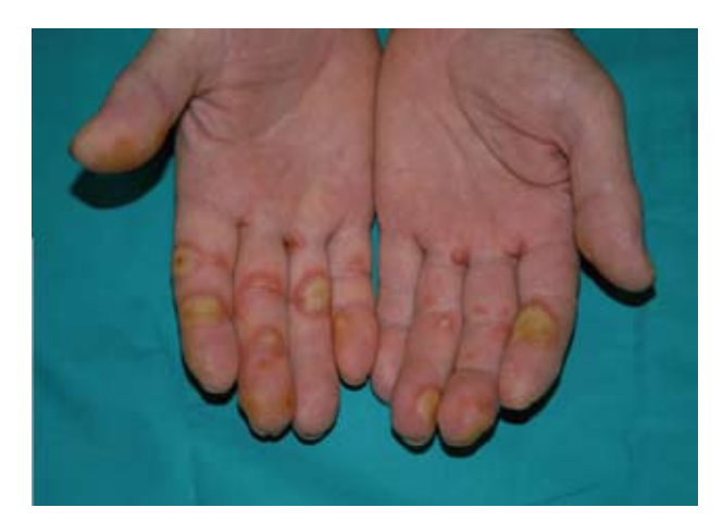
Figure 1. Yellowish hyperkeratotic papules with symmetrical erythematous halo.

Sorafenib is a new oral drug currently approved for the treatment of metastatic renal cell carcinoma and hepatocellular carcinoma. The drug acts partly by inhibiting the tyrosine kinase receptors implicated in angiogenesis and tumor progression, and partly by blocking Raf kinase pathways. Up to 90% of patients receiving this treatment are reported to develop dermatological sideeffects. Hyperkeratosis-like lesions commonly appear on the pressure pads of palms and soles and this may require withdrawal of the medication in more serious cases.<sup>1,2</sup>