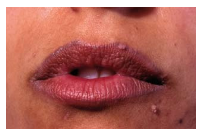
Figure 6. Development of viral warts after micropigmentation of lip outline.