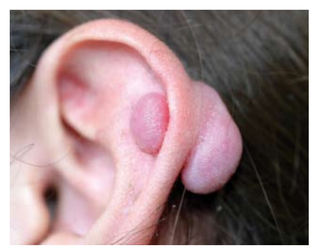
Figure 8. Keloid after a piercing.

experienced hypovolemic shock following a tongue piercing.<sup>119</sup>