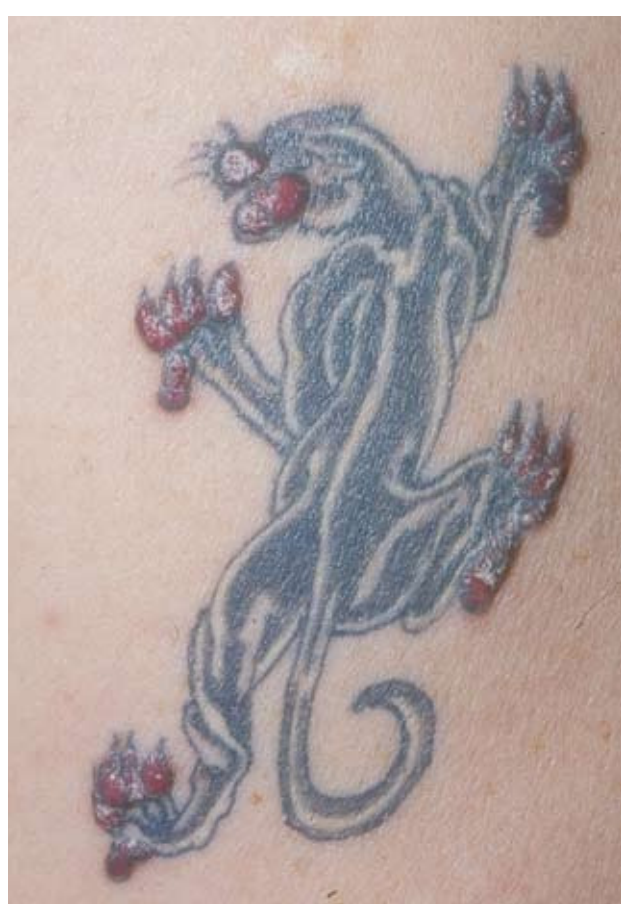
Figure 4. Delayed inflammatory reaction caused by red pigment. The histologic study showed a pseudolymphomatous histologic pattern.

condition has also been described in various infections, staining studies are advisable to rule out fungal, bacterial, and mycobacterial infection. ^{26}