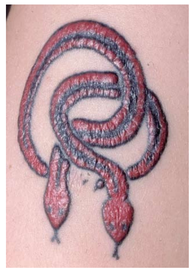
Figure 2. Lichenoid inflammatory reaction caused by red pigment.