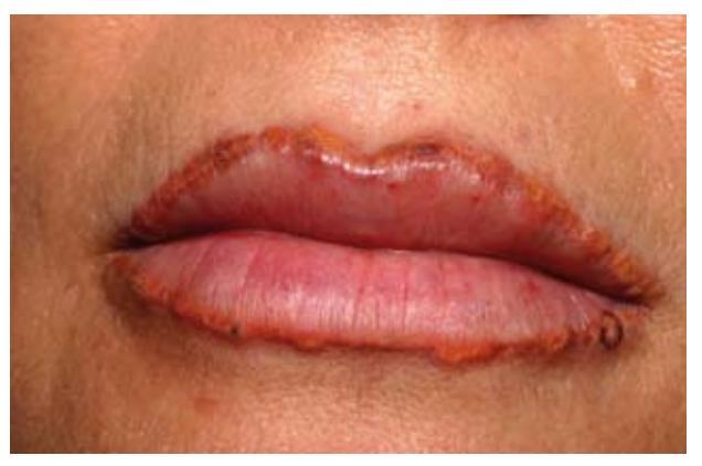
Figure 3. Granulomatous inflammatory reaction following micropigmentation of lip outline.