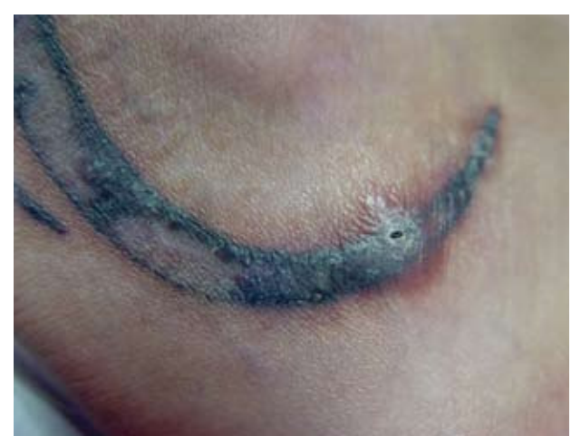
Figure 5. Abscess due to Pseudomonas aeruginosa . The microbiology study showed that the pigment container was contaminated with this microorganism.