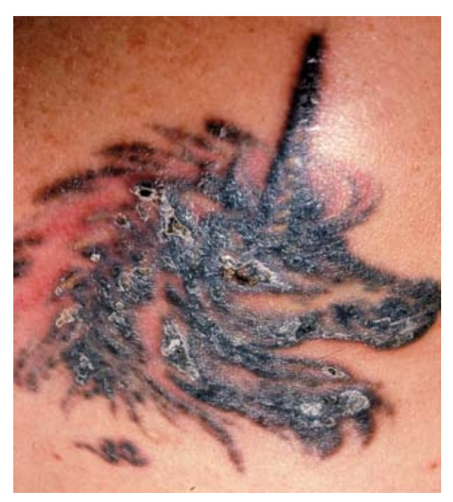
Figure 1. Eczematous inflammatory reaction caused by black pigment.