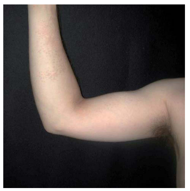
Figure 2. Guttate morphea lesions on the right forearm and inner aspect of the upper arm. Note how these lesions coalesce on the forearm.

The following tests were requested: routine blood and urine tests, protein electrophoresis, immunoglobulin and complement concentrations, and serological tests for Borrelia , antinuclear antibodies (ANAs), anti-DNA antibodies, and anticentromere antibodies (including anti-Scl-70 antibodies).