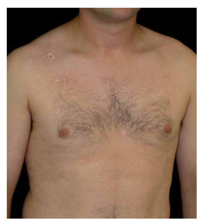
Figure 4. Guttate morphea lesions on the chest. The 2 whitish plaques in the right pectoral region are suggestive of lichen sclerosus et atrophicus.