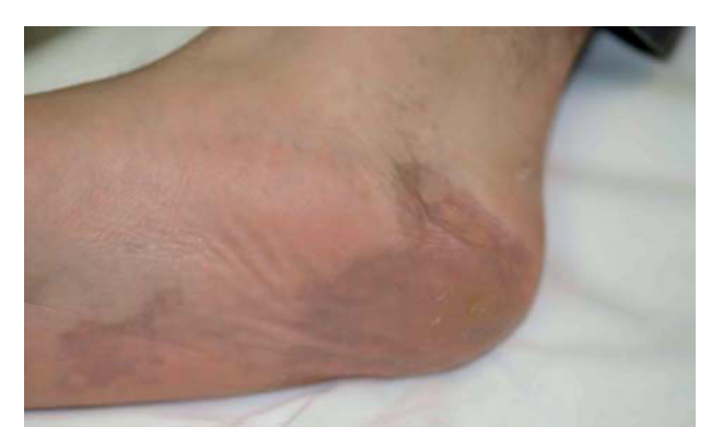
Figure 1. Morphea plaque on heel.