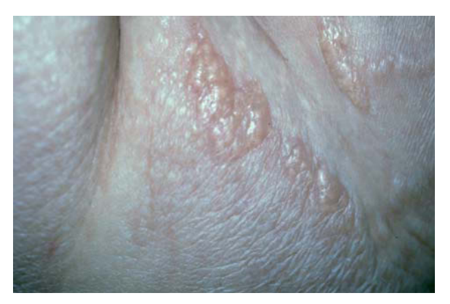
Figure 1. Bullous lesions on the lower abdomen.