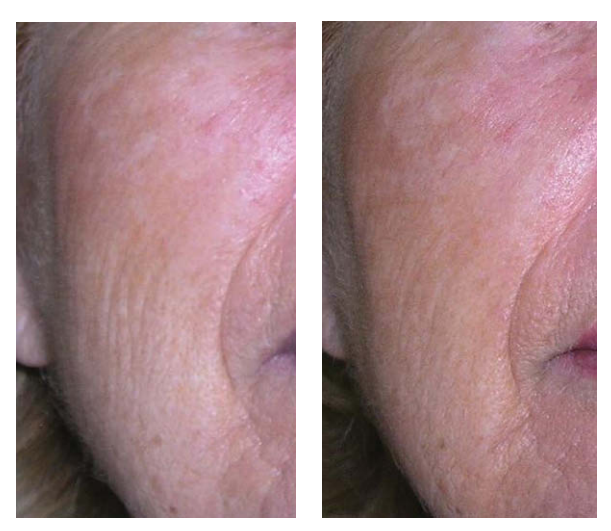
Figure 10. Photodynamic photorejuvenation. Left panel, prior to treatment; right panel, after treatment. There is a visible reduction in the depth of the wrinkles along with more homogeneous pigmentation (images kindly provided by Dr. Jaén).

2. Necrosis of all layers of the epidermis is seen in the tumoral and pretumoral areas between 1 and 3 days after the session.