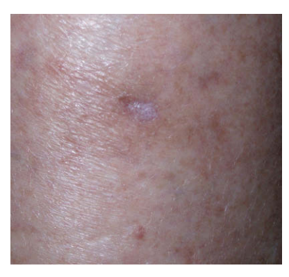
Figure 5. The lesion is visibly cured with a good cosmetic result following 2 sessions of photodynamic therapy a week apart (methyl aminolevulinate, red light, 35 J/cm<sup>2</sup>, 3 hours). No recurrence had occurred at 1-year follow-up.

The studies published to date on treatment of squamous cell carcinoma, KS, Paget disease, and cutaneous B-cell lymphoma reveal poor results from small case series or isolated cases that prevent reliable conclusions from being drawn.