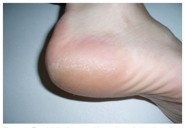
Figure 9. Result following 6 weekly sessions of photodynamic therapy (methyl aminolevulinate, 7 mm pulsed dye laser, 7 J/cm<sup>2</sup>, 6 milliseconds).

a dermatologist. A series of 6 treatments over the course of 9 weeks has been shown to be effective in recalcitrant warts. The response is assessed after 3 sessions and if it is complete the treatment is considered finalized; if the response is incomplete the treatment is continued for another 3 sessions. If after 18 weeks from the beginning of treatment the warts are still not resolved, treatment is considered to have failed.<sup>27</sup>