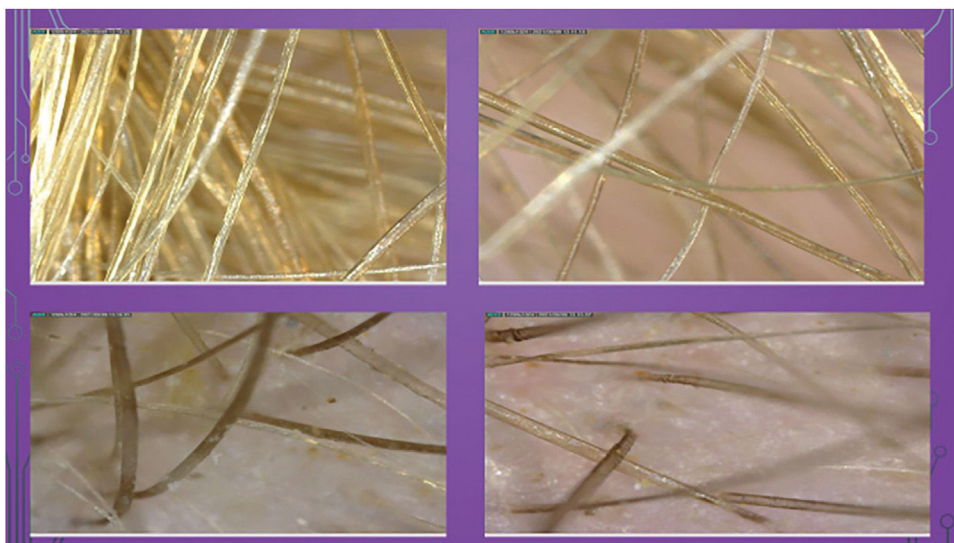
Figure 2 Trichoscopy showing grooved hairs emerging in different directions and crossing each other.