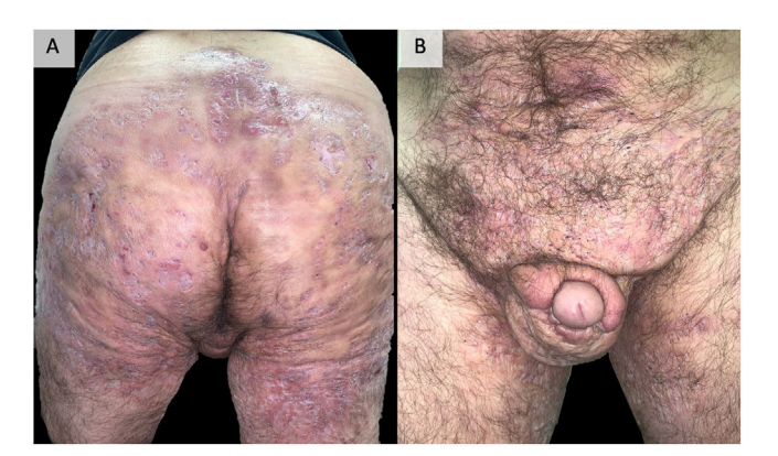
Figure 2 Example of extremely serious hidradenitis suppurativa. A 48-year-old man with HS of >20 years' duration, refractory to multiple treatments, including high-dose adalimumab, infliximab, and ustekinumab. Currently, in treatment with bimekizumab. Photographs taken and published with the oral and written consent of the patient .

imsidolimab<sup>91</sup>). Rituximab, a monoclonal anti-CD-20 agent, is postulated as a possible therapeutic weapon, its effectiveness being postulated in 5 cases described in the literature.<sup>92</sup> Iscalimab (CFZ533) is a monoclonal antibody that blocks the CD-40 pathway, and it is being studied in the treatment of the HS on a phase II trial (NCT03827798).<sup>93</sup> LYS 006, an oral leukotriene A4 hydrolase (LTA4) inhibitor, is being evaluated in a phase II trial for the treatment of HS (NCT03827798).<sup>93</sup> LY 3041658, a monoclonal antibody that blocks chemokines that bind to CXCR1 and CXCR2 receptors, is also being evaluated in a phase 2 trial (NCT04493502).<sup>94</sup> Finally, CSL 324 is a phase 1 anti-G-CSF antibody for the treatment of HS and palmoplantar pustulosis (NCT03972280).<sup>95</sup>