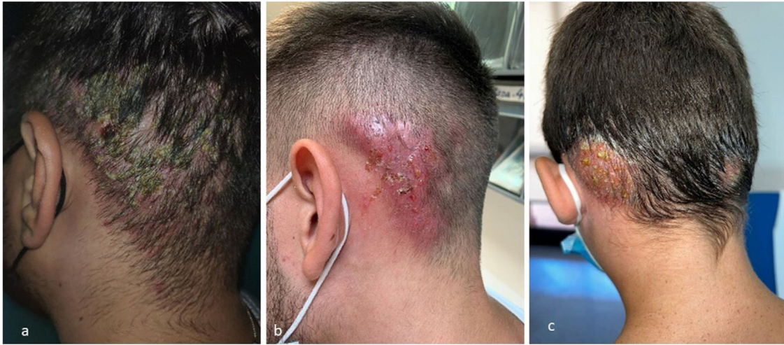
Figure 3 Inflammatory forms.