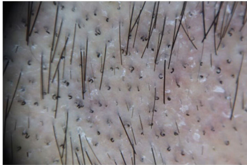
Figure 4 Trichoscopic image of corkscrew hairs, typical of black dot ringworm caused by T. tonsurans .

cases in Spain nor the geographic distribution but rather provide a sufficiently representative sample of cases to define the clinical pattern, etiology, and response to treatment. The outbreak affects almost exclusively young males who frequently shave the back of the head and temporal area in