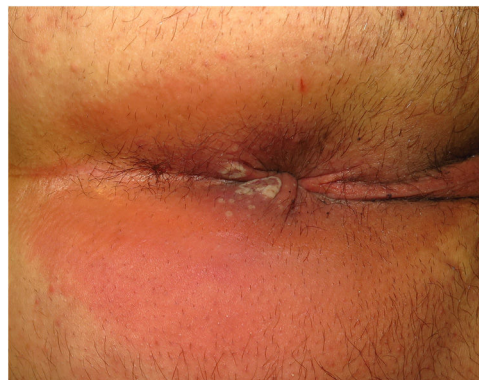
Figure 2 Multiple perianal pseudopustules, some crater-shaped with erosive centers.

Other forms of presentation include perioral pseudopustules, lesions on the tongue—which are usually white papules with a central depression—or ulcerated lesions of the oral